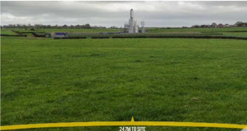
Photomontage of drilling operations at Preston New Road at 247m