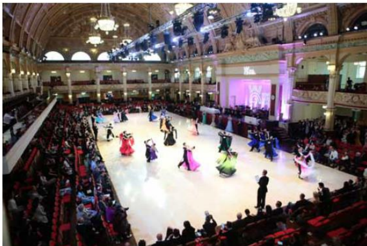
Digitav provided cloud computing services for the Blackpool Dance Festival. Inset, Ian Mallam